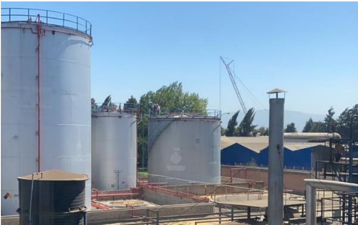
Alcohol tanks onsite

After installing new storage tanks onsite, the site operator required a continuous and precise temperature monitoring system with the intention of implementing a preventative system instead of simply reacting to critical events afterwards. Our system provides this possibility with early detection and the generation of pre-alarms when abnormal temperature conditions arise.